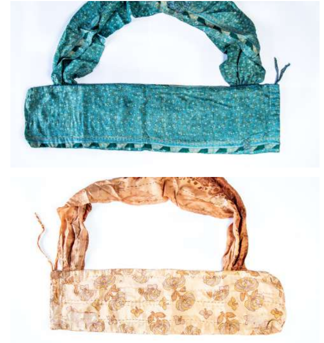
Gulshan Yoga Mat Bag

Multiple silk sarees | Cotton padded lining | Fold over with button loop closure | Code: FOLD CLUTCH 2