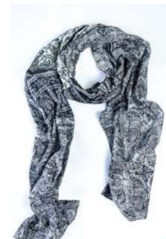
Tayyaba Embroidered Infinity Scarf