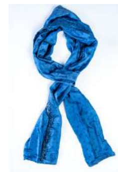
Sangeetha Single Pattern Infinity Scarf

Sangeetha Meaning: Music One silk saree | Double-layered | Sewn into infinity loop shape | Single hidden stitch around edges | Code: PZI