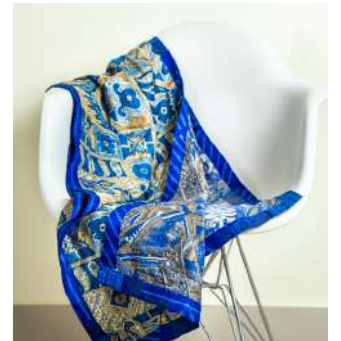
Zinat Silk with Cotton Inner Throw