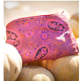
Jadu Patches Clutch Set of 3