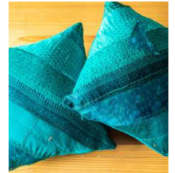
Rani Patchwork Pillow Cover Large