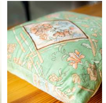
Falaknuma Single Pattern Pillow Cover Large

Falaknuma Meaning: Name of Hyderabad's most luxurious palace. One silk saree | Zip closure | Hand-embroidered details | Comes as single pillow case only | Code: PLW2 Lrg