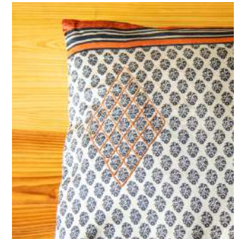
Sapna Two Sided Pillow Cover Large