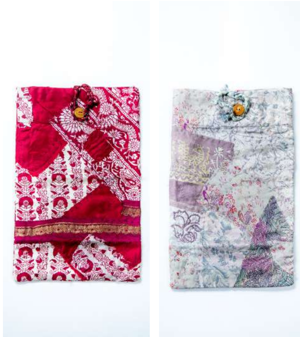
Sona Long Fold Over Clutch

Multiple silk sarees | Cotton padded lining | Internal pocket | Fold over with button loop closure | Code: FOLD CLUTCH 1