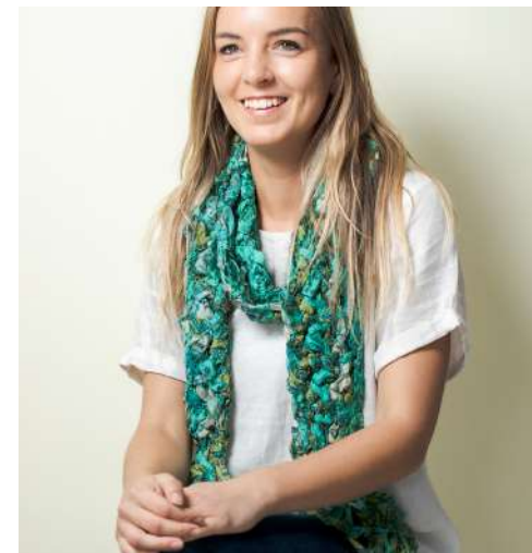
Maleka Crochet Infinity Scarf

Maleka Meaning: Jasmine, life a beautiful scent Multiple silk sarees | Loosely hand crocheted fabric | Sewn into an infinity loop | Code: CI