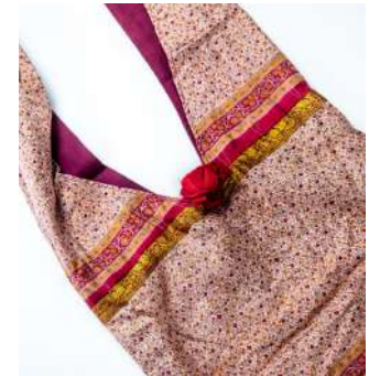
Jaan Mini Sling Bag