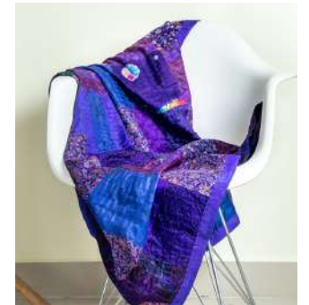
Kahani Silk Throw with Embroidery