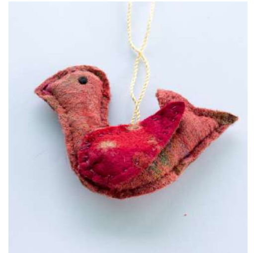
Birds Set of 2

Multiple silk sarees are turned into felting fabric using complimentary colours | Set of 2 comes with one medium ornament and one small ornament | Code: BIRDS