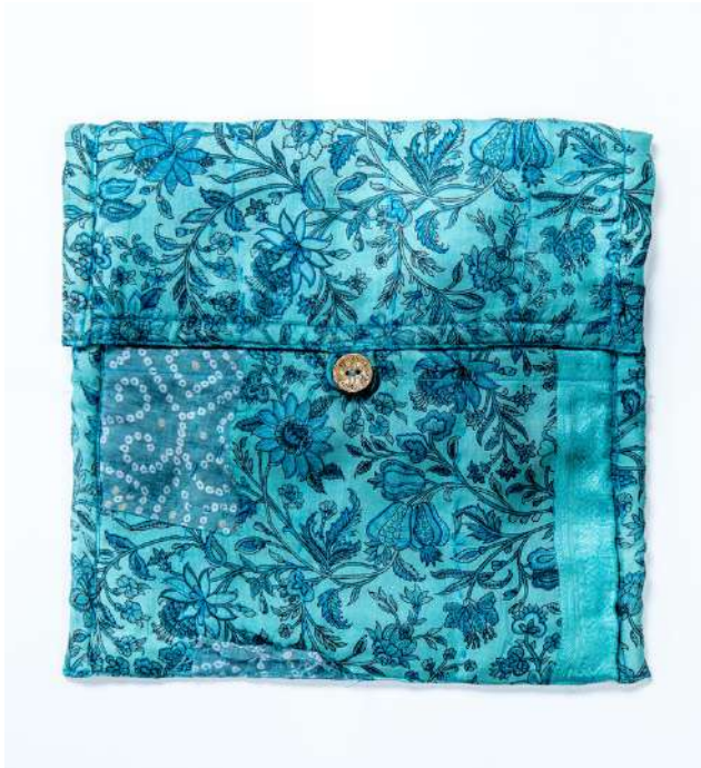
Janya Square Fold Over Clutch