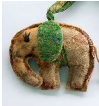
Elephants Set of 2

Multiple silk sarees are turned into felting fabric using complimentary colours | Set of 2 comes with one medium ornament and one small ornament | Code: EL2