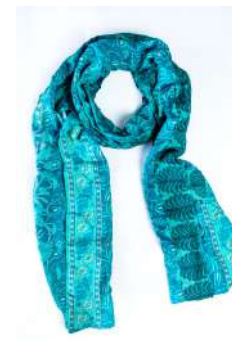
Muskaan Two Sided Flat Scarf