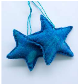
Stars Set of 2

Multiple silk sarees are turned into felting fabric using complimentary colours | Set of 2 comes with one medium ornament and one small ornament | Code: STR2